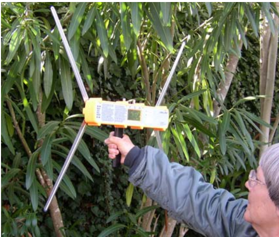
Figure 2. Operating Position for VHF Frequencies (108–174 MHz) (antenna elements fanned out to 120° position).

Unfold the antenna blades and handle by holding the receiver body with one hand while unfolding the four antenna blades and then the handle to their operating positions. Return them to the stored position in reverse order (handle then blades). For optimum DF accuracy when operating on frequencies between 108 and 174 MHz, fan the antennas to the detent at 120° outwards. See Figure 2. For 215 to 270 MHz, set them in the 90° position., as shown in Figure 3. The antennas may be left in the fanned or 120° position when switching between 121.5 and 243 MHz; only a slight decrease in accuracy will result.