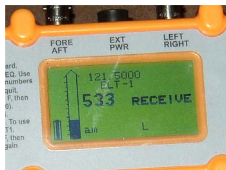
Figure 5. L-Per ® Operating Screen in the Receive Mode.

The DF will show one or more minimum amplitude points, often called nulls, but these change depending on tuning and should not be used for determining direction. This mode also eliminates the “buzz” present in the DF mode and makes speech easier to understand. A numerical indication supplements the vertical bar to indicate signal strength, with about 400 being the weakest signal and about 850 the strongest.