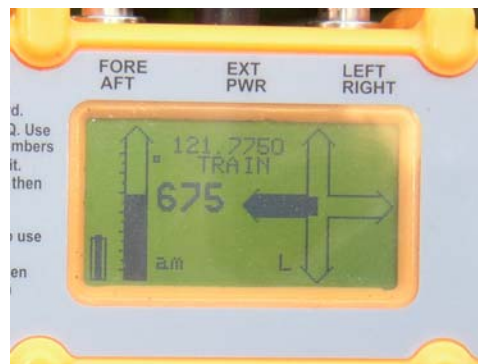
Figure 4. L-Per ® Operating Screen in the DF Mode.

Figure 4 shows the operating screen in DF mode with the various condition indicators.