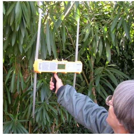
Figure 3. Operating Position for UHF Frequencies (215–270 MHz) (antenna elements in vertical or 90° position).

To turn the receiver on, hold the PWR key down for 2-3 seconds. It will beep and the display will come on. To turn the DF off, hold the PWR key down for one second. It will store the frequency and display settings currently being used, “beep,” print “OFF” on the screen, and shut down when the key is released.